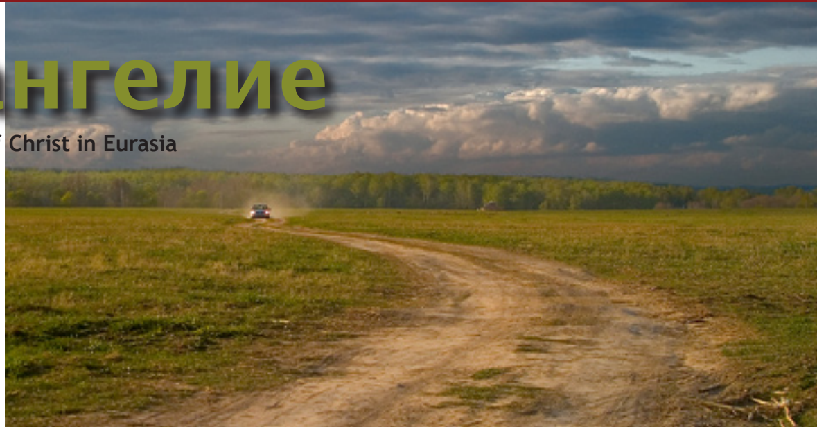
Russian Field

Therefore we will not fear, though the earth give way and the mountains fall into the heart of the sea. . .