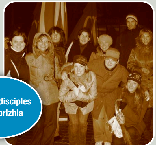
Team of disciples in Zaporizhia